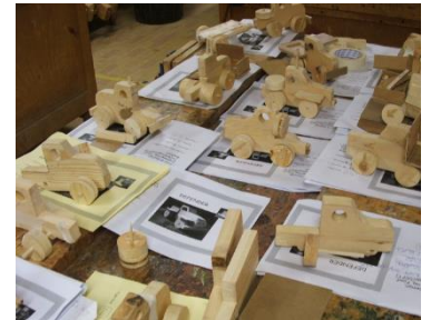
Image shows a 'car park' of DEFENDER Great British design icon wooden toy ready for fitting out with students bespoke rear cab designs. Students learn how to use a template and hand tools to produce a basic uniform design and then create their own bespoke DEFENDER variant.