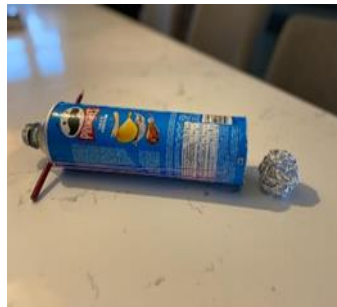
Emelia R – 7B1