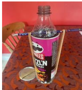
Finley W – 8S1