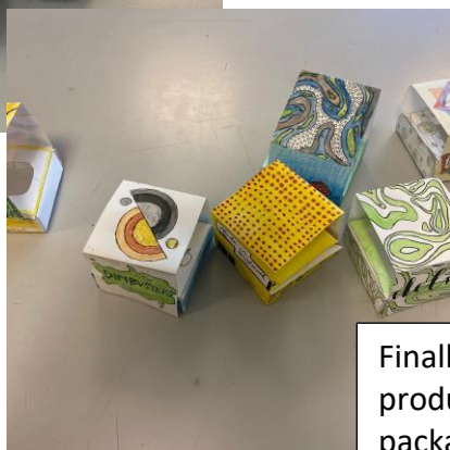
Finally – how to present the final product - designing and making packaging