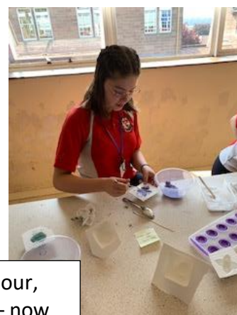
Next - choosing colour, scent and texture – now ready to make!