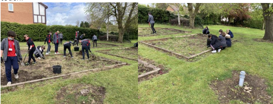
Year 9 students working on the 'grow our own' vegetable patch.

If you are able to donate any spare gardening equipment/seed/plants, please email flinders@qegs.email to get in touch.