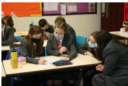
Year 10 students solving puzzles and tasks.

Over the last week or so, Years 7-10 have been taking part in a Maths challenge, competing against each other in lesson in their house teams. The puzzles and tasks have involved students working on their teamwork, problem solving, logical thinking and number skills. We can now announce that the winning house team is.... Hull! Well done Hull. In second place, only 12 points behind, were Boothby.