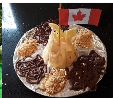
Winner! Imogen P, Y8 Teacake travels around the world - Canada