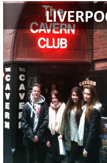
LIVERPOOL AND NORTH WALES