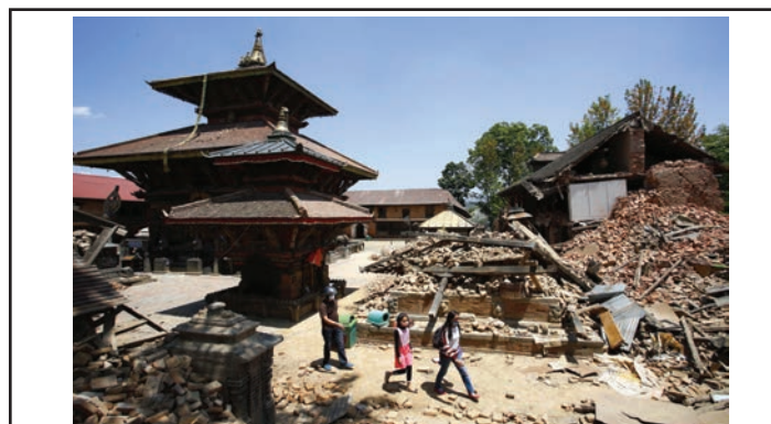
Figure 4. Destruction of Changu Narayan Temple, oldest in Nepal, UNESCO World Heritage Site.

90% of tourist bookings were cancelled in the immediate aftermath, as trekking routes and World Heritage sites in Kathmandu valley were damaged (Figure 4). Whilst this sector is expected to recover quickly if no more seismic activity occurs, $600million will be lost during 2015-2017.